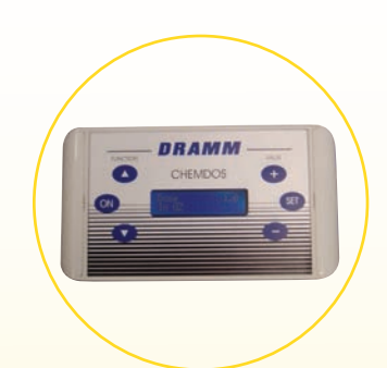
Easy to Program