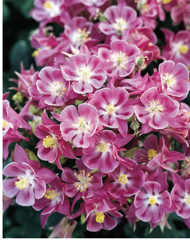
'Winky Blue-White' (left), along with 'Winky Red-White' and 'Winky Rose-Rose' (right), received the Fleuroselect Quality Medal.