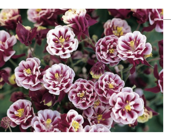
Winky Double Red-White' was awarded the Fleuroselect Novelty Medal.